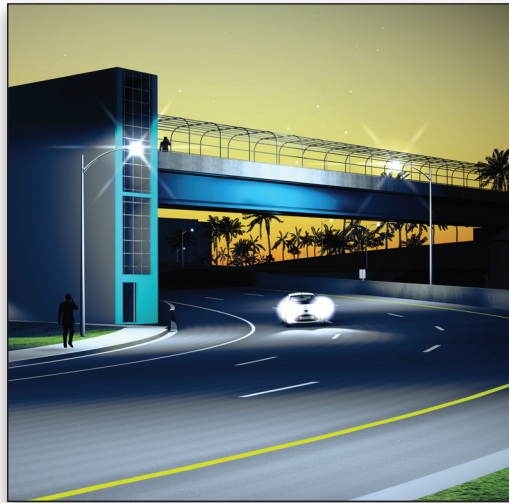
OpenRoads helped with modeling and design, creating an innovative design for better project visualization and engaging marketing material.

Another way that AECOM improved project visualization was by implementing civil infrastructure information modeling (CIIM). This practice allowed the team to visualize the potential designs and measure performance features, such as sight lines and vehicular clearances. Performing these analyses during the design phase was crucial to keep the project on schedule and meet client demands. CIIM is also leading the organization-wide effort of going digital, implementing more digital technologies into its workflows.